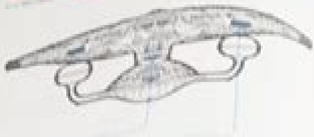
Diagram illustrating the structure of the human skull, showing the eye socket, nasal cavity, and jaw structure.

Text describing the structure and function of the human skull, including the eye socket, nasal cavity, and jaw structure.