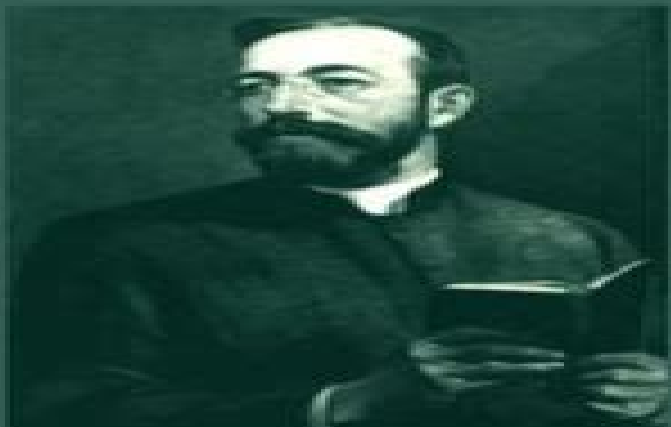
Thomas E. Woods Jr.