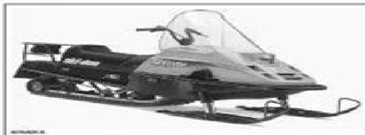
TYPICAL — TUNDRA R